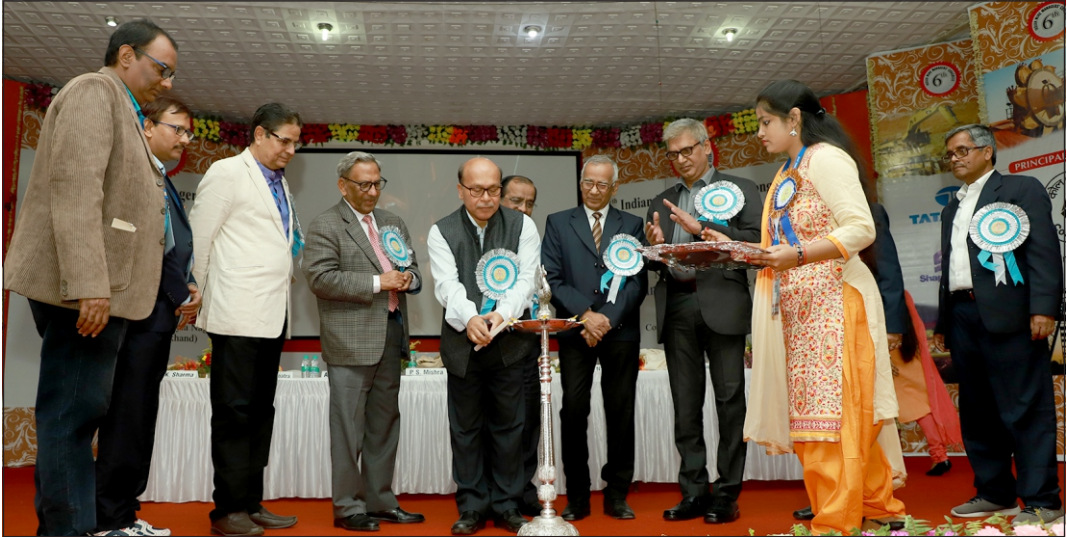
MICO 18 Inaugural Session