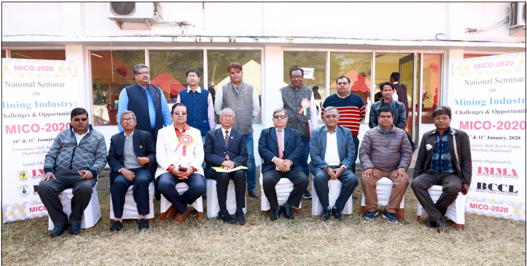
MICO 2020 2nd Day