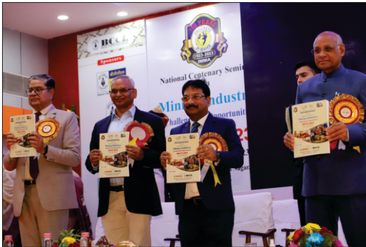
Honorable Governor of Jharkhand as a Chief Guest of MICO'23