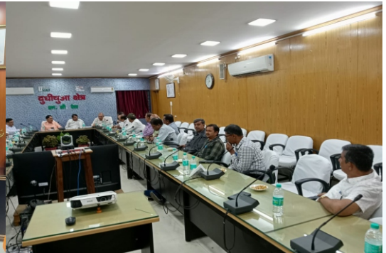
Dudichua Area, NCL