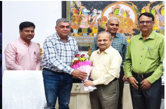
Smabalpur Chapter with CMD MCL