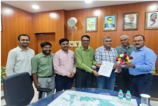
Sambalpur Chapter with DT